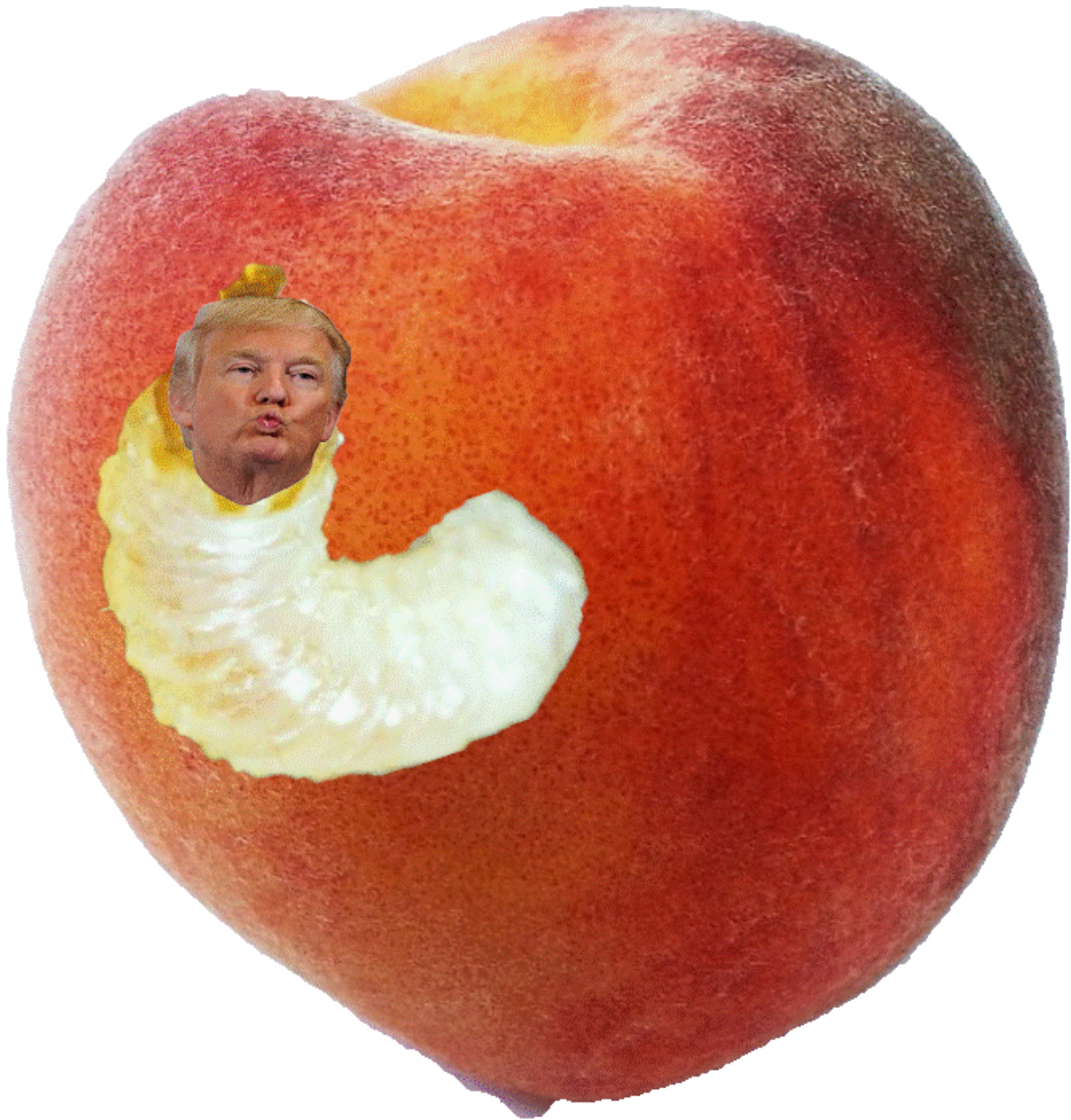
Lesser Peach Worm

This story's distribution setting is on. You're in the Partner Program, so this story is eligible to earn money. Learn more